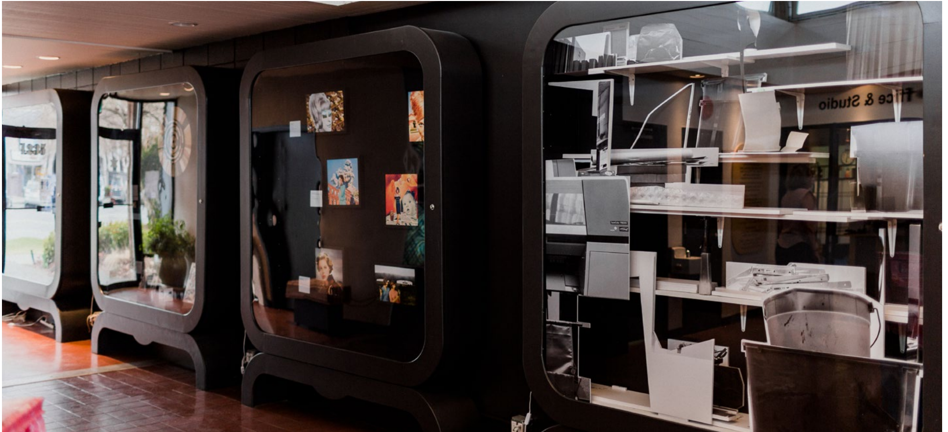
Collage, sans colle: No Order -The Broad Reach Of Collage (Exhibition overview: presented at the CRAG from March 1 – Nov. 18, 2019).