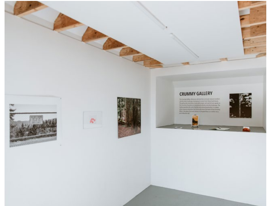
Image credit: Cedric, Nathan & Jim Bomford: Rest Stop & Crummy Gallery , (Exhibition overview: presented at the CRAG from Sept. 21 - November 18, 2019). Copyright: Bluetree Photography.